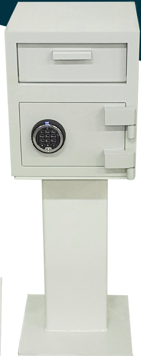
DS1 DEPOSIT SAFE WITH 600mm PEDESTAL

Staff can easily deposit cash into the Safe and a Manager can hold the code to the Electronic Lock for end of day balancing.